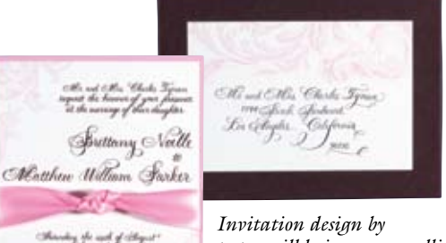
papermilldesigns.com; calligraphy by calligraphybyjennifer.net.